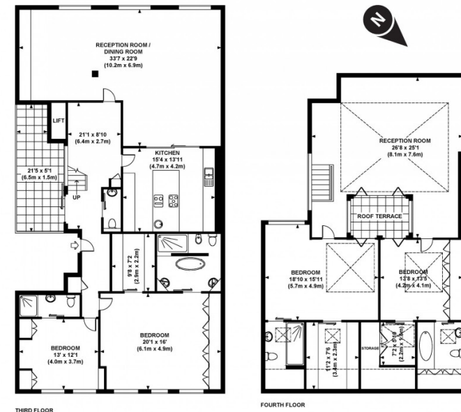
Prince's Gate, SW7

Approx. gross internal area 3167 Sq.Ft. / 294.2 Sq.M. 3300 Sq.Ft. / 306.6 Sq.M. Inc. Restricted Height Area & Storage