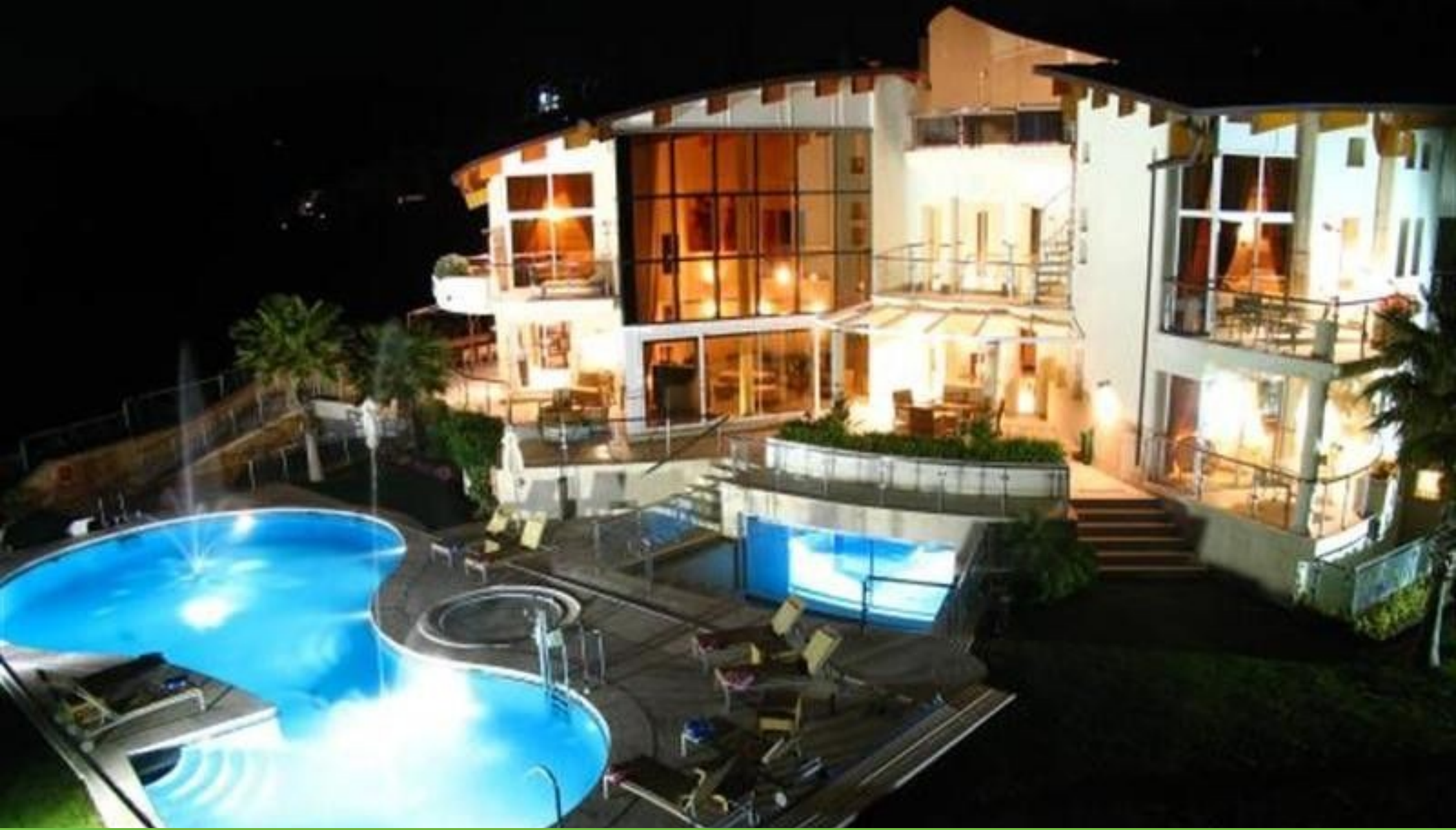
Los Flamingos, $7,500,000